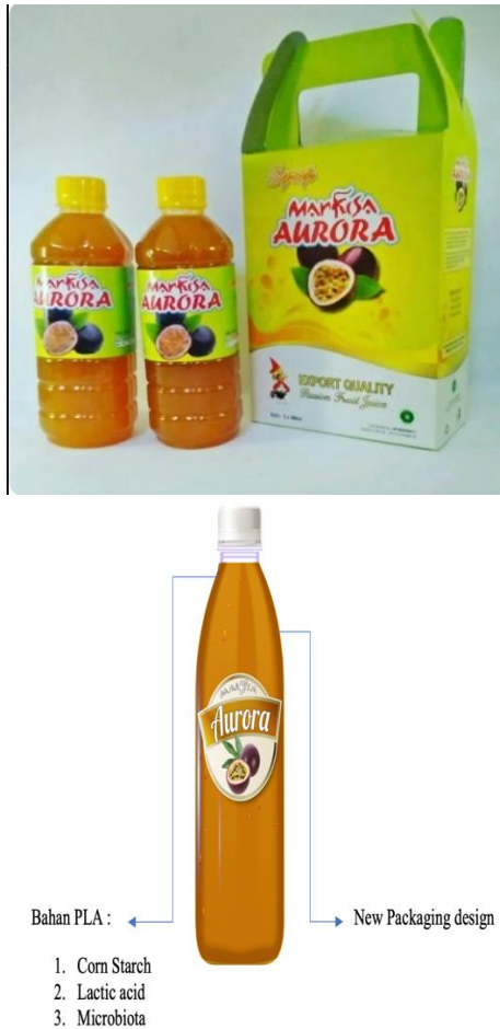
Figure 3. Old packaging & new packaging

not make the most optimal design in some cases due to cost, technology, or other factors.